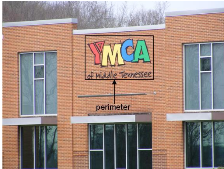
Example of copy without distinct background