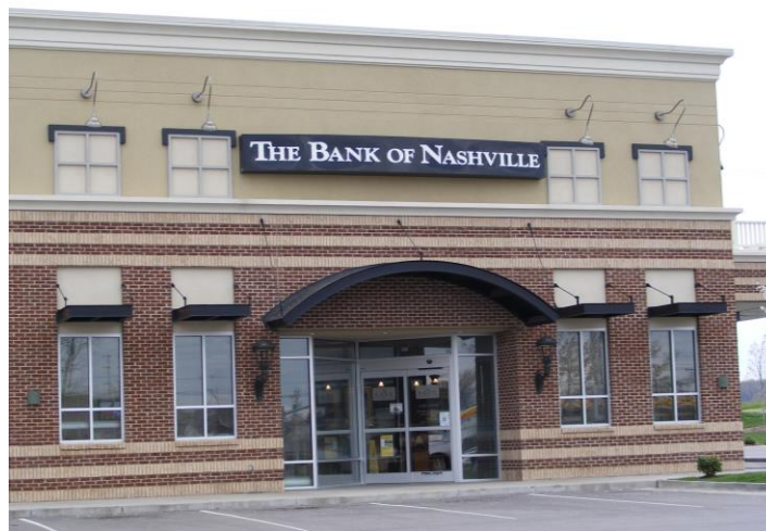
Example of copy and background as integrated unit